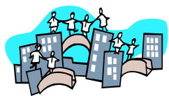
Collaboration yields better health for more people at lower cost.

Project Access in North Carolina: A physician-led initiative to coordinate all aspects of health care under one grand scheme. Participating hospitals have reduced ER usage for non-acute, non-emergency and preventable cases by 9 percent.